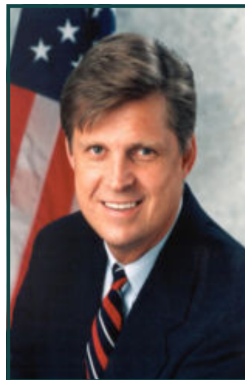
Todd Tiaht 4th Congressional District of Kansas

Tiaht, who also visited the Hunter Health Clinic in