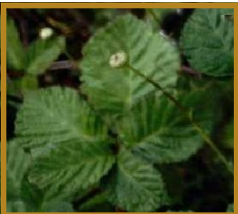
A seed is planted.

A HG counselor made a presentation and I was immediately mesmerized by the impact it had on our group. She shared experiential activities with the class and I thought, "Wow, I would really like to be a part of this". I had not heard of another program that was taking this approach with their clients. The seed was planted.