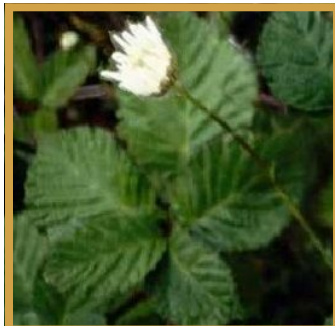
It begins to sprout...

the impact that substances have had on their lives, but will also give them the opportunity to learn about themselves. The seeds begin to sprout.